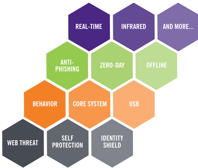
Webroot Multi-Vector Protection

heightened state of awareness and closely interrogates any new files or processes that are introduced into the system. Infrared also interprets user behaviors and their overall safety level. If a user is classified as “high risk”, Webroot then dynamically tailors malware prevention to that user, while preventing false positives for less risky users.